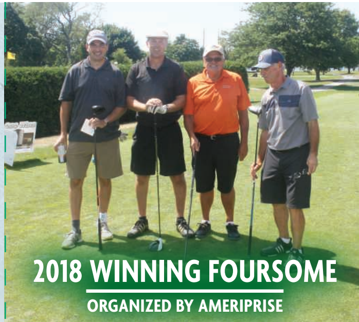
2018 WINNING FOURSOME ORGANIZED BY AMERIPRISE