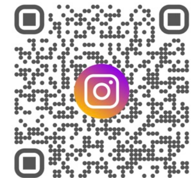
SCAN ME WITH YOUR SMART DEVICE'S CAMERA TO FOLLOW AND SHARE YOUR SCOUTING ADVENTURES