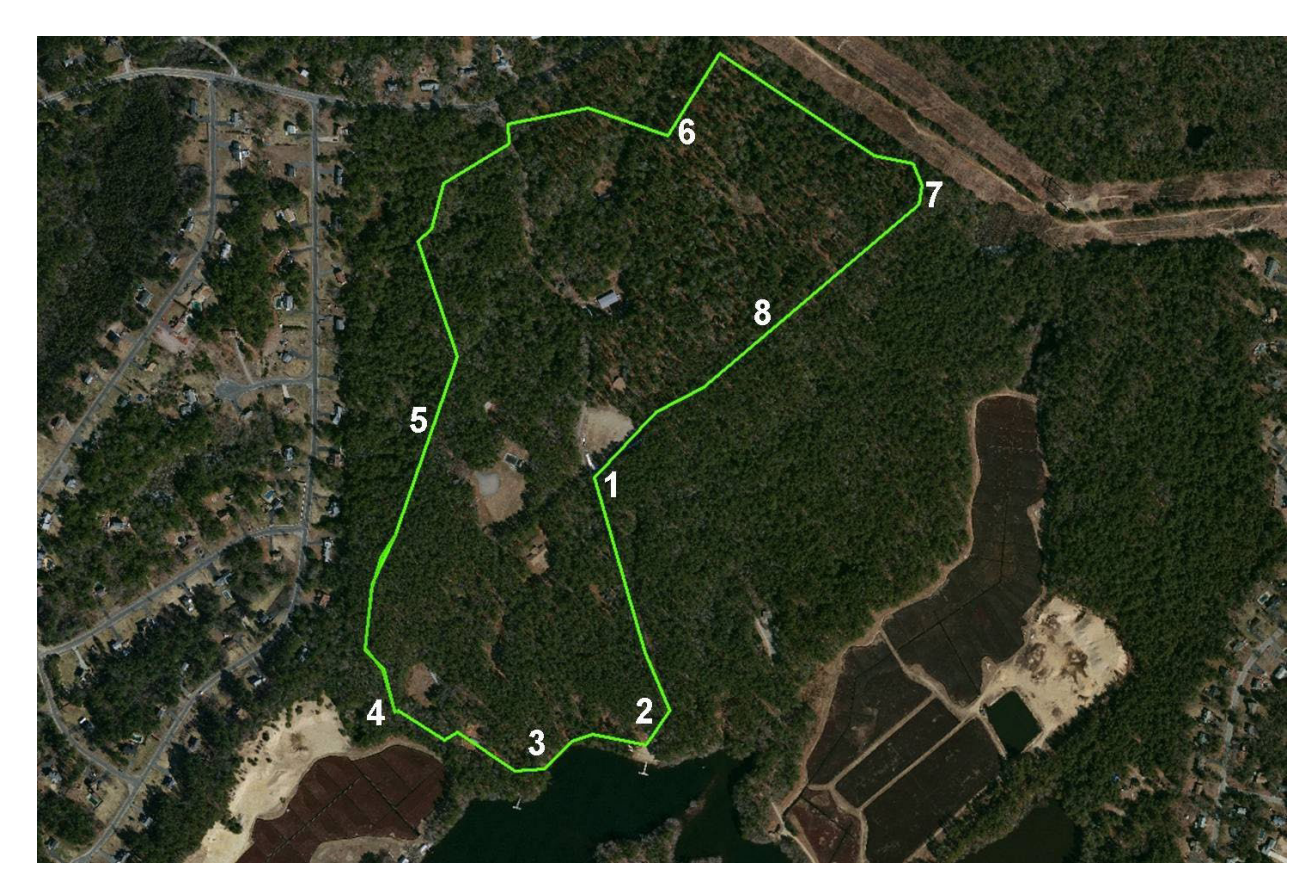
Aerial Photograph of Camp Norse with the Conservation Trail demarcated in Green and the Reference Stations numbered in White.