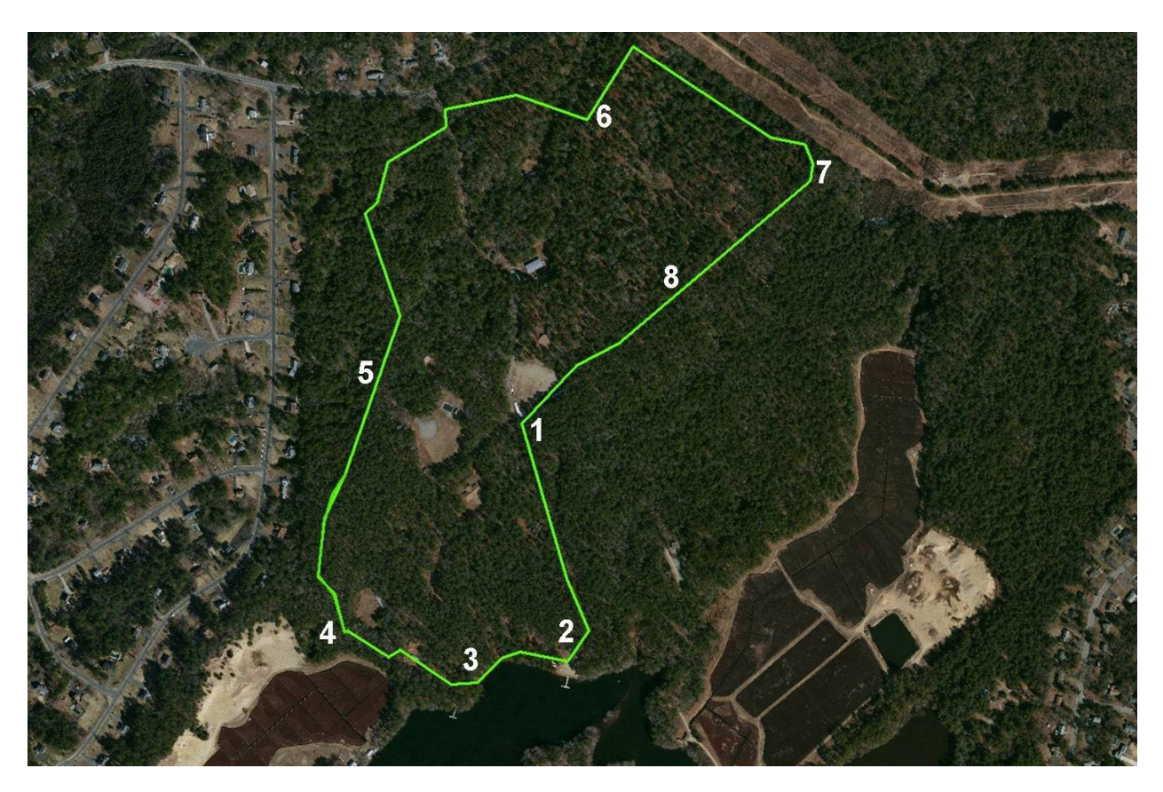
Aerial Photograph of Camp Norse with the Conservation Trail demarcated in Green and the Reference Stations numbered in White.